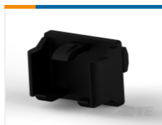
TE Part # 1761394-1 DUST COVER, SFP, GANGED & STACKED