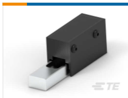
TE Part # 2215077-3 ASSY, SEATING TOOL, SFP