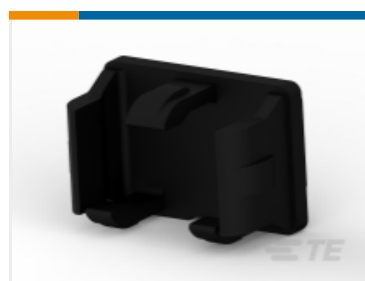
TE Part # 1367147-3 SFP COVER, UNPL, NO LOGO