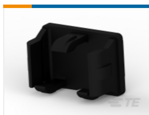
TE Part # 1367147-1 SFP COVER, UNPLATED